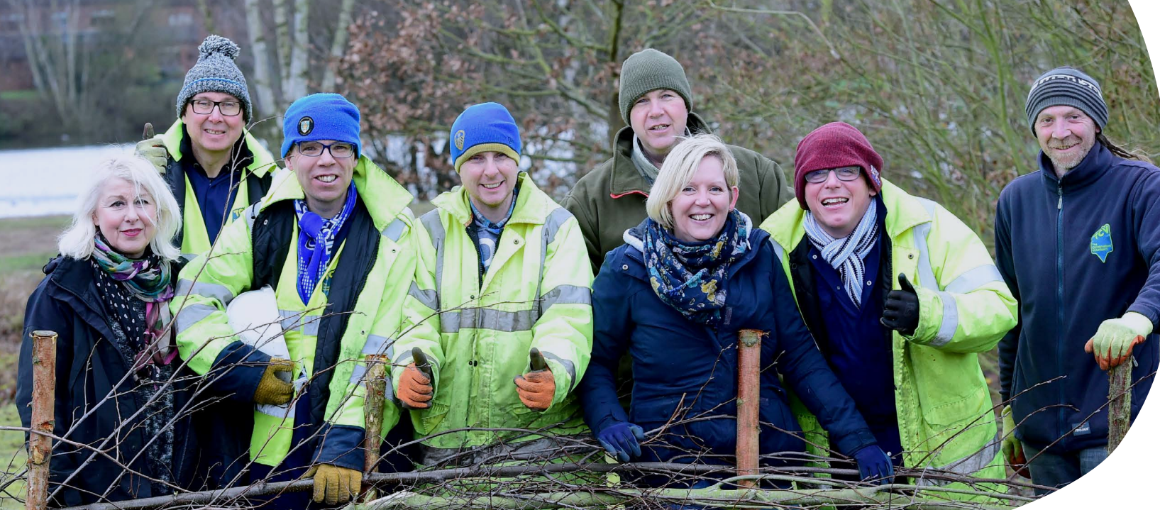
LEFT: These volunteers at Hartsholme Country Park are doing something they enjoy while contributing to the community.