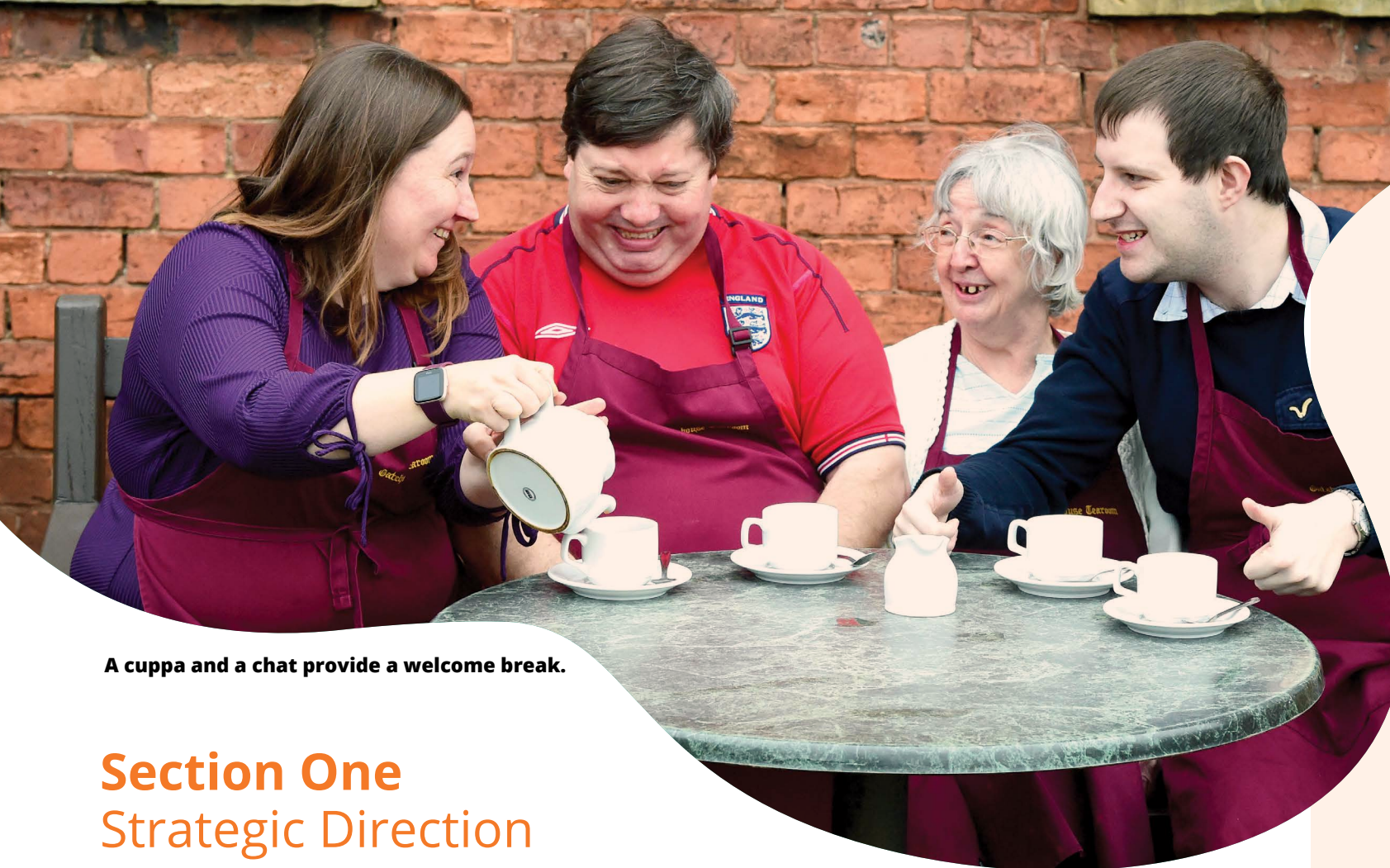
A cuppa and a chat provide a welcome break.